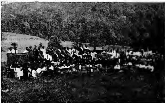
A SUMMER CONFERENCE OF COLORED STUDENT ASSOCIATIONS

In practically every Negro college the Association is standing for positive Christian standards both in personal and in community life. In the white colleges an active program is well under way for promoting both among faculties and students a thorough study of Negro life and the Christian basis of race relationships.